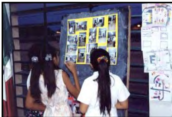
Looking at Photos of the SELT Clausura

The setting, El Palacio Municipal, was ideal. It was a space we had used from beginning to end, from inscripciones [SELT registration] to adult classes to the clausura. Not only was it a continuing site for events, but it also showed the collaboration involved in the language school. The space belongs to Pisté, but it was shared with us (the field school) and the community at large to facilitate a coming together of people for the purpose of learning language, practicing ethnography, and simply getting to know one another. El Palacio Municipal was one of the central zones of contact, not only for those of us directly involved in teaching and learning there, but also for the observers (from both the field school and the community). Also, the fact that so many different events take place there, from baptism parties to wedding receptions to art exhibitions to drunken incarcerations, liberated the event from the confines of a school structure and idea, and opened it up to a more generalized community event. I, at least, felt much more relaxed and open at El Palacio than I would have at La Primaria.